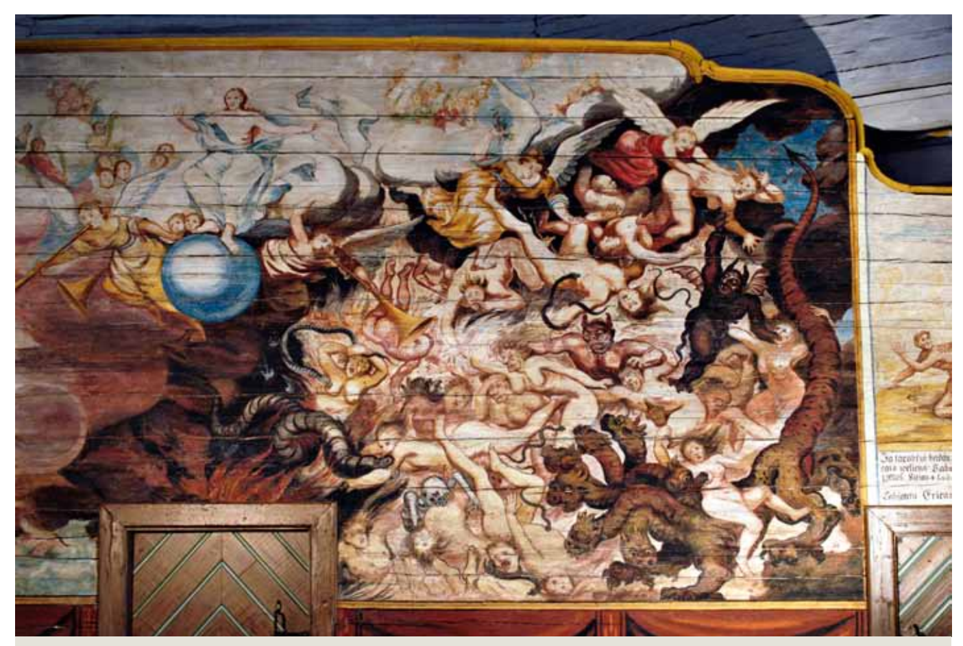
A detail from an original wall painting The Last Judgment, painted in 1779 by the Finnish church painter Mikael Toppelius, located in the Church of Haukipudas, Finland.